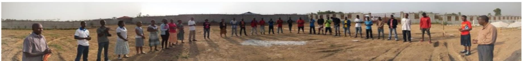
HWHL Medical Center Groundbreaking Ceremony January 7, 2015